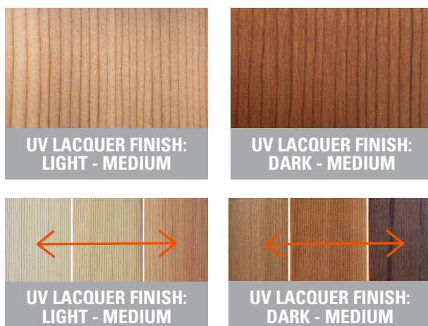
Image above depicts naturally occurring variance in Light-Medium Timber.

Vertilux UV Lacquer Finish undergoes the same process as the Oil Finish, however, the latest in UV protection lacquer is used. During the manufacturing process the slats are evenly graded and vacuum coated in a single pass to ensure all four sides of each slat have a completely even finish.