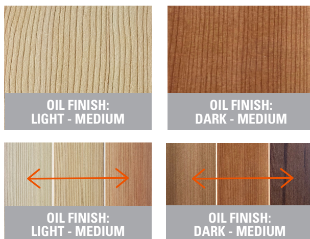
Image above depicts naturally occurring variance in Light-Medium Timber.

Vertilux Cedarline Oil Finish is aerated and naturally dried prior to manufacture, increasing its attractiveness and durability. It exceeds Australian standards for colourfastness and to highlight the natural grain the latest in UV protection oil is used.